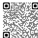
Baptist Medical Center